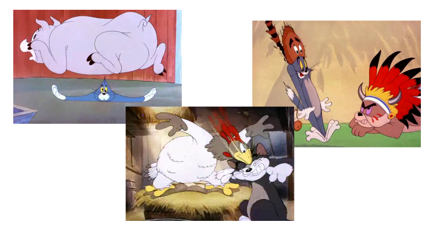
Example of fine art from the ACM Lab

The ACM Lab is going to hold an exhibition of the collection of fine art created by pigs, dogs and hens. There are N pieces of artwork, which will be displayed in two exhibition sites. We've decided to hold multiple exhibitions so that every pair of pieces would have been displayed in different sites . To be more specific, for every exhibition we split the artwork into two groups. After a couple of exhibitions, every pair of art should have been in different groups at least once. As holding an exhibition costs, and has the risk of damaging the artwork, we want to hold the least number of exhibitions while still achieving the goal. Can you help determine the number of exhibitions we should hold?